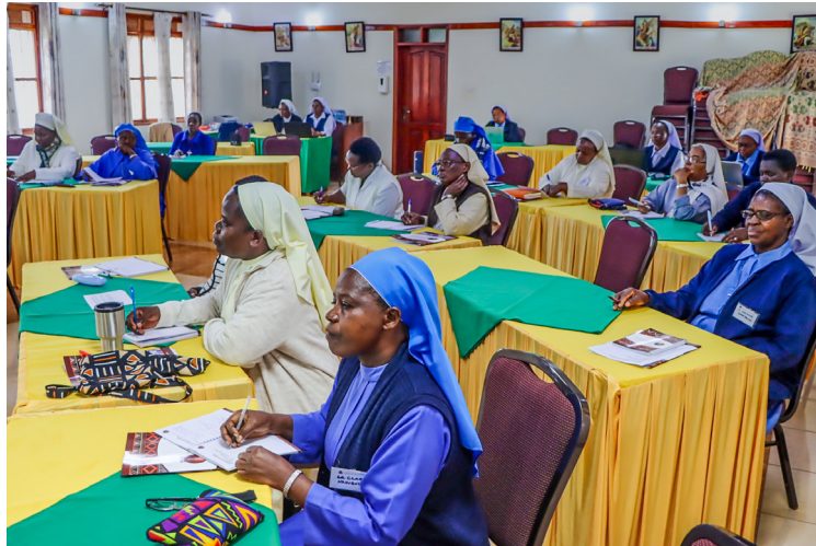
Participants of Professional Development for Congregational Leaders attending the training at ARU Secretariat.

PDCL is a holistic program that focuses on the person of the superior, the congregation/institute as an organization, and the mission of the institute. This entails content materials are person oriented, organization oriented and mission oriented for superiors so that they are able to empower their own sisters in the formation of mindset.