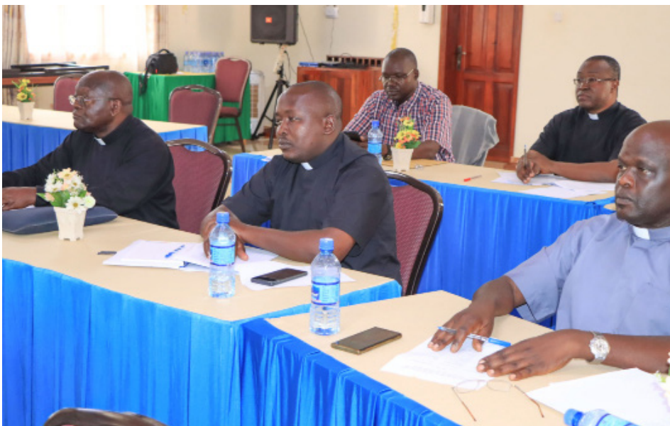
A cross-section of the participants of the incharges of Small Christian Communities in the Dioceses of Uganda, during their planning meeting at ARU Secretariat.

The celebration of the golden jubilee dates back in the subsequent AMECEA plenary meetings that confirmed the establishment of SCCs as a way forward for the Church in the AMECEA region to become really local. That is, self-ministering, self-propagating and self-supporting. The AMECEA Bishops affirmed!