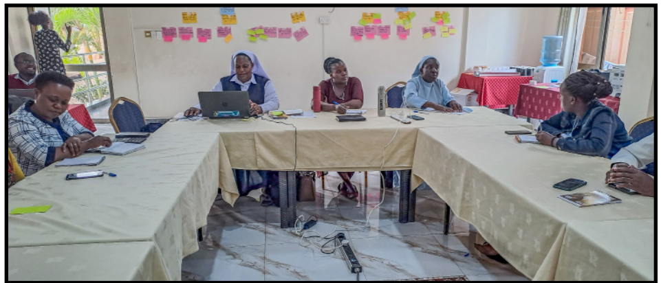
Training of Trainers (ToT) in progress at Imperial Botanical Beach Hotel – Entebbe.

Together, CRS, CCCU, partners and the Government of Uganda demonstrated that true transformation is possible when different stakeholders come together for a common cause for a brighter future for Uganda's vulnerable children, leaving a permanent mark on the landscape of care and protection in the country.