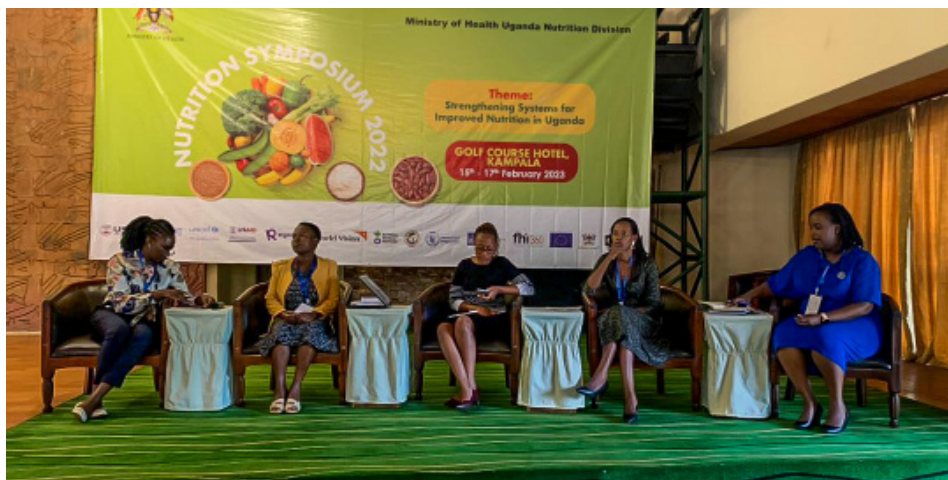
A panel of facilitators during the ARU-CCCU National nutrition symposium.