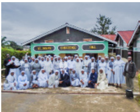
Participants in a group photo during field sessions

Consultation on psychosocial wellness and mental health, counselling services for families and children, seminars and courses for professional growth, depression counselling, stress management counselling, career counselling, retirement and retrenchment counselling, terminal illness therapy, family therapy, transition psychotherapy, crisis counselling and many more.