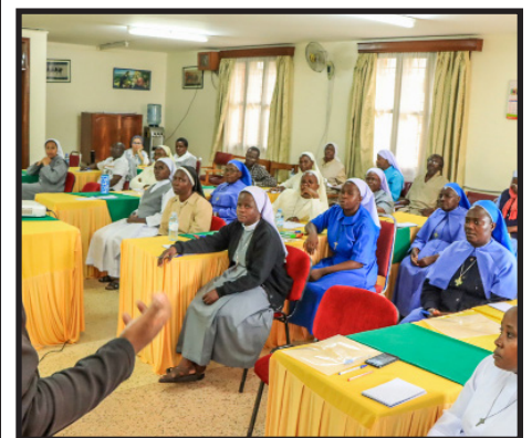
Participants keenly listening to the facilitators during the training on addiction.

Tremors, impaired judgement, obsessiveness, malnourishment, total loss of self-care, coupled with fears and vague spiritual desires will kick in at the fourth stage of addiction if the person does not reflect on their life and change to sobriety.