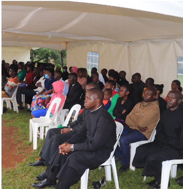
A crosssection of Seminarians and lay people who turned up for the world day of prayer for vocations at Ggaba major seminary.

Fr. Pontiano calls all to pray for vocations and work zealously to defend and support the Church in all ways.