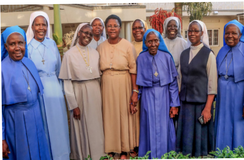
ARU General Chapter facilitators pose for a memorial group photo outside ARU Secretariat garden.