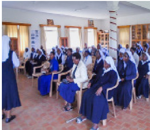
Participants of CNSP in a session during field sessions

CNSP gives an opportunity to institutes of consecrated life and societies of apostolic life to consult on issues concerning human development, life transitions, age and aging, mental health, diverse encounters in religious life, psychotherapy, as well topics for formation and development of peoples especially, members of the Institute and their mission challenges. People will be helped to develop awareness, perception and satisfaction towards counselling so that they become positive about seeking counselling and encouraging others to seek it before they get into alarming mental situations.