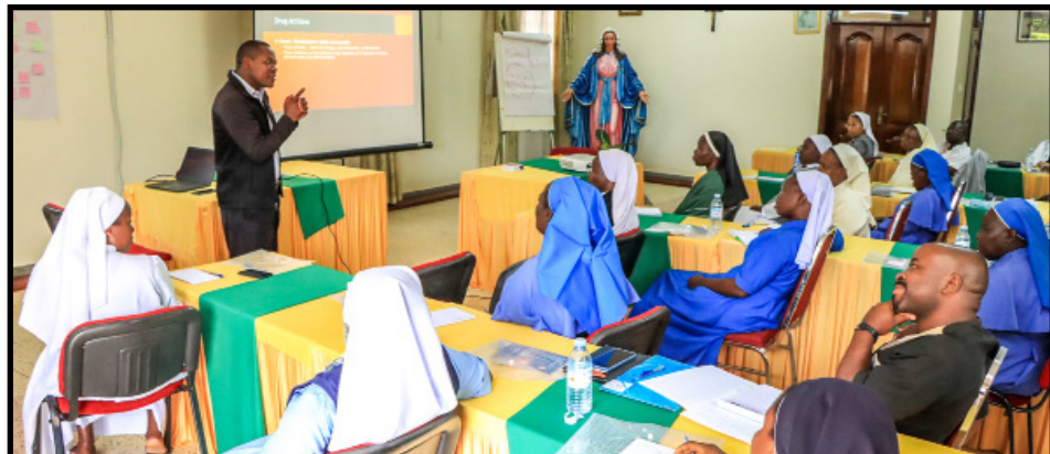
Participants in a training session on addiction at ARU Secretariat, Holy Family Hall, Nsambya.

The concept of half-life in addiction explains best how drugs accumulate in the body. For example, when a person takes four bottles of beer a day, the body can only get rid of two of them a day. This indicates that a person needs two days in order to drink again. However,