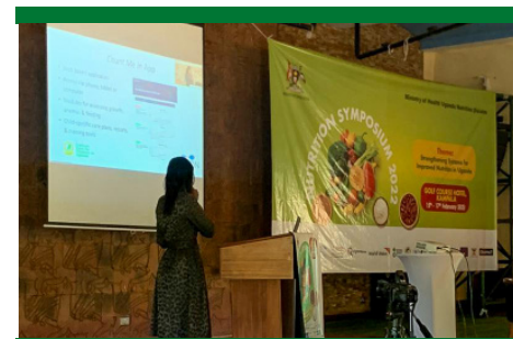
A facilitator making a presentation during the symposium. Courtesy photo.