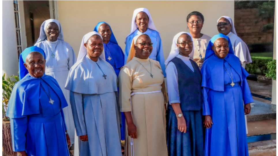
The team of general chapter facilitators in a group photo after their meeting at ARU Secretariat, Nsambya Kampala.

Finally, the Good News! Good News! The General Chapters have a new name and a new face with a “ BIG SMILE. ” General Chapters are now taken as a time of “ CELEBRATION, APPRECIATION for BLESSINGS RECEIVED, A TIME OF EXPRESSING GRATITUDE ” to the Leadership teams for services rendered. All members come together at the end of a General Chapter to celebrate as an Institute.