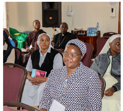
Consecrated persons attentively listen to facilitators of the General Assembly at ARU Secretariat.