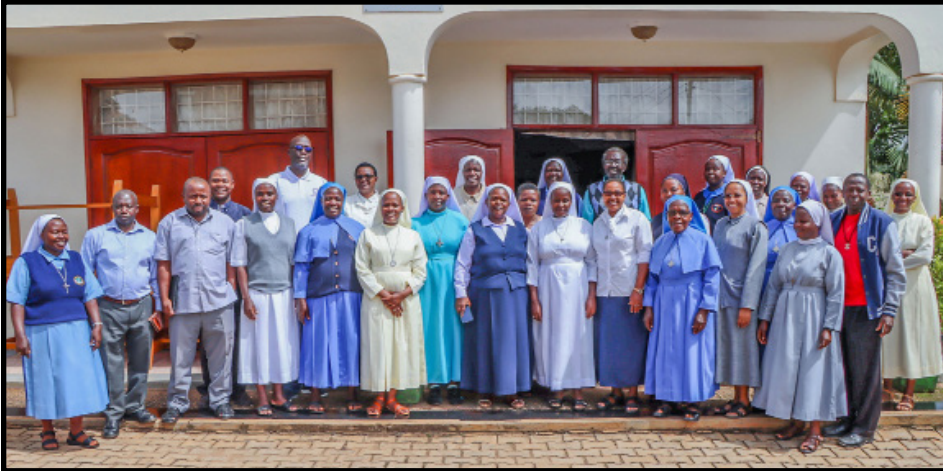
Formators and facilitators in a memorial photo at ARU Secretariat shortly after the successful completion of the training on addiction.