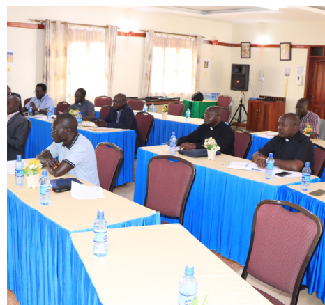
Some of the participants in attendance, during the SCCs planning meeting at ARU Secretariat.