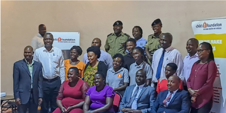
Child i Foundation Staffs pose for a group with some Stakeholders during the closure event.