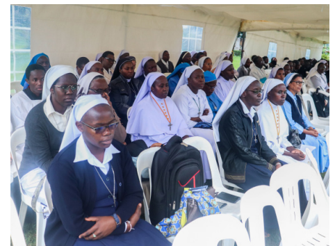
A cross-section of Sisters from different Institutes attending the the world day of prayer for vocations at St. Mbaaga, Ggaba Major Seminary.

The Lord does not want a big number of consecrated persons but rather he desires individuals who are genuinely poor, chaste and obedient to his teachings. There is a fall in consecrated life today. But we should also remember that the Lord himself fell three times on his way to Calvary.