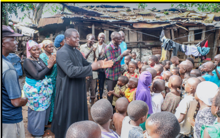
Director PMS and Team, Kampala Archdiocese, among kids of informal settlement at Katwe, Kampala.

Conclusively, PMS has teamed with St. Daniel Comboni Centre. They are determined to continue with advocacy and awareness on responsible parenting. This intervention targets communities of Karamoja region with continuous campaign against human trafficking. The team urges the Church to have intentional and strategic pastoral programs on safe guarding and promoting the rights of all children inclusively by constituting a diocesan child protection unit. They also urge the government to support construction of transit centers where children are rehabilitated, later reintegrated and reconciled with their biological communities.