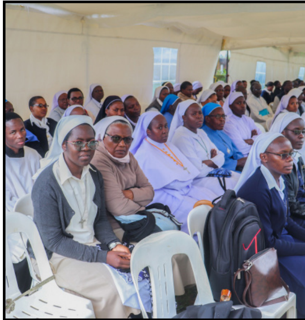
Consecrated Women and Men who turned up for the world day of prayer for vocations at St. Mbaaga, Ggaba major seminary.

Let us not concentrate on professionalism but be true witnesses to the Gospel of Christ by being genuine, compassionate, charitable and present consecrated persons here and now!