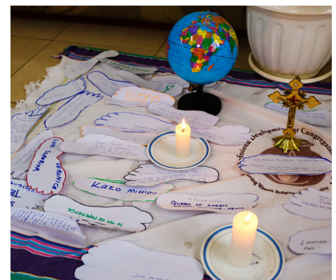
Some of the symbols used by professional development for congregational leaders.