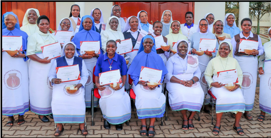
Consecrated persons graduate after successful completion of Professional Development for Congregational Leadership (PDCL) training at ARU Secretariat.