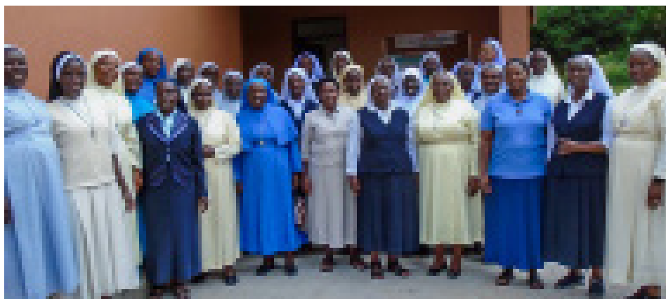
Counselors pose for a memorial photo after session.