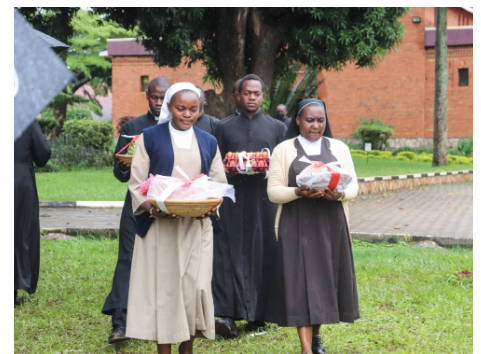
Consecrated persons take offertory gifts during the world day of prayer for vocations.

in sort of symbiosis -interdependence, interconnectedness, interpenetration! Without married couples with children, there would be no vocations to the priesthood and religious life. And without the vocations to the priesthood, we would have just a sacrament-less Church. This vocation Sunday is meant to raise awareness for the need to pray and attract more vocations to the priesthood and the religious life.