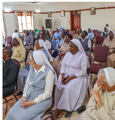
Consecrated persons attentively listen to the presentation on the disgraceful LGBTQ+ attack on family.