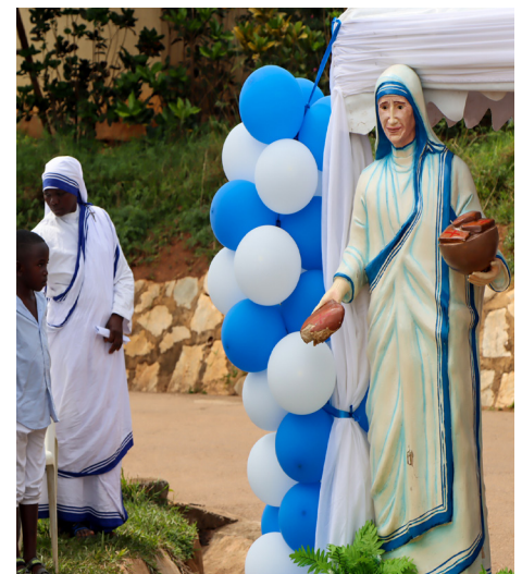
The statue of Mother Theresa during her jubilee celebrations organized by Sisters of charity.