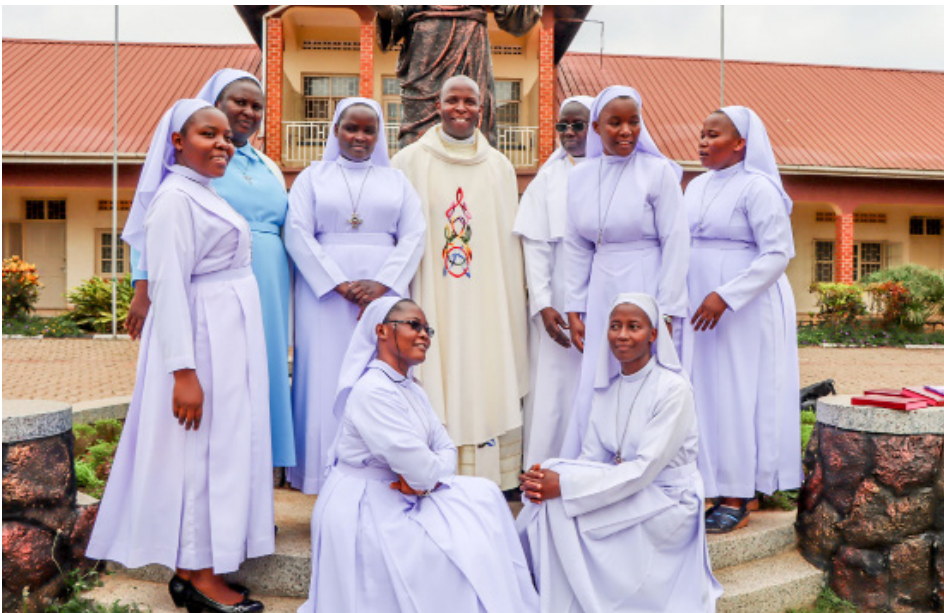
Some of the junior professed sisters share a light moment with ARU members at St. Mbaaga Ggaba Natinal Seminary