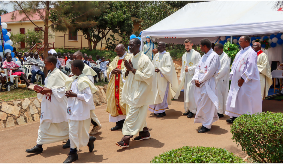
Priests process after Eucharistic celebration on the jubilee celebrations of Mother Theresa, Photo by ARU Reporter.