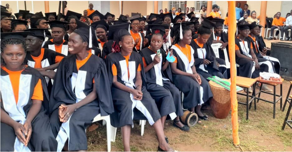
Sister Led Youth Initiative Register Success as some of the youth graduate.