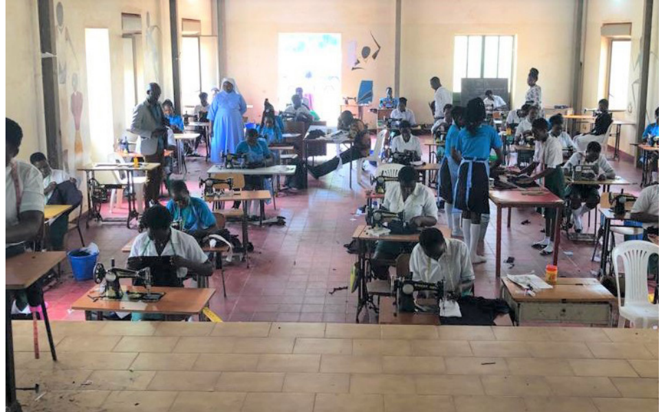
The youth undergoing tailoring skill training, initiated by Sisters to make youth self sustaining and self employed.