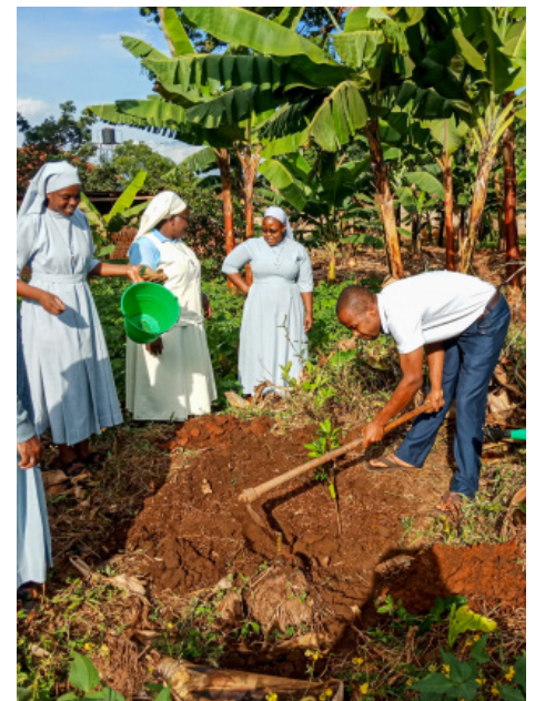
Leading by example, consecrated persons plant a memorial tree seedlings to mark the celebration of the season of creation 2022

the event was later embraced by other European churches in 2001 and then the world council of Churches. Pope Francis made another turn-around in 2015 with the encyclical Laudato Si . Based on St. Francis, the Patron Saint of ecology, 2.2 billion Christians came together to embrace all the ecological realities. With Laudato Si Action platform animated by the consecrated persons, care for the common home is shifting to a higher level! The burning bush is the Symbol for the Season of Creation 2022. Today, the prevalence of unnatural fires are a sign of the devastating effects that climate change has on the most vulnerable of our planet. Creation cries out as forests crackle, animals flee, and people are forced to migrate due to the fires of injustice.