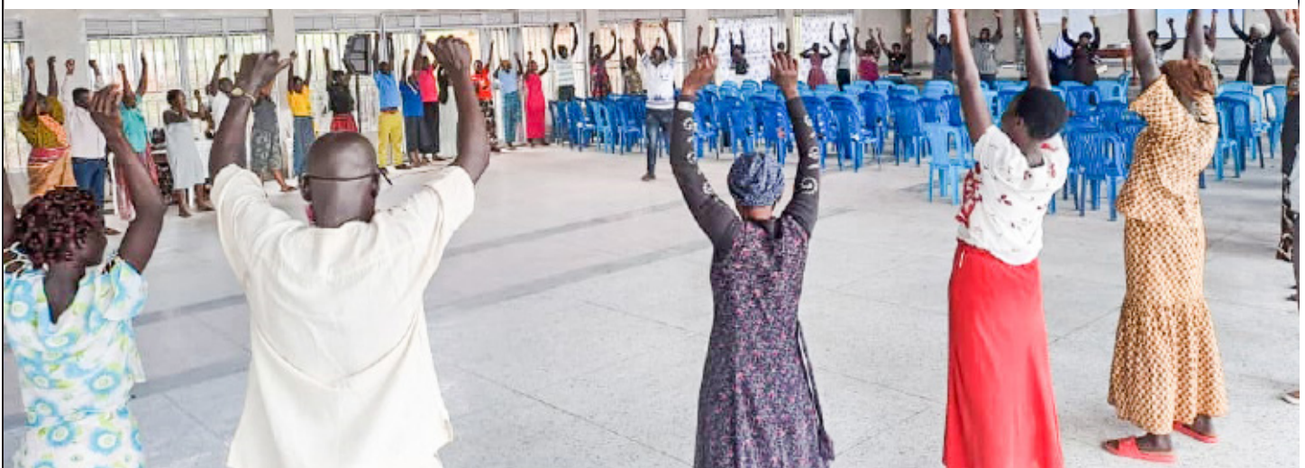
Some excercises and stretching during the animation of parenting skills carried out by Sisters. Courtesy photo from the field.