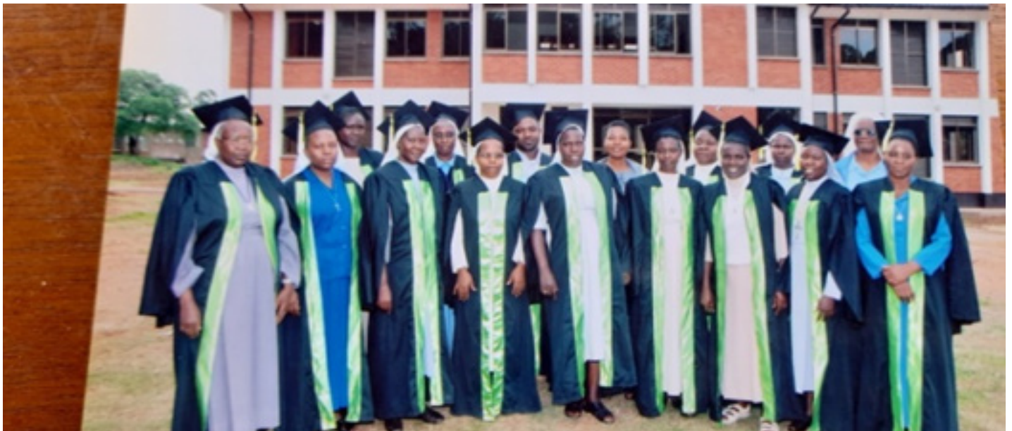
Consecrated Women graduate, as a tale of a success story of the All Africa Conference Sisters to Sister.

The curriculum review of TEF programme is ongoing; the committee had several meetings with discussions focusing on the relevance of the course to those who train with the hope of getting job elsewhere after training in the programme. Finally, members resolved to change the name of the programme to “Transformation Faith and Human Development” (TFHD) instead of Transformative Education and Faith (TEF).