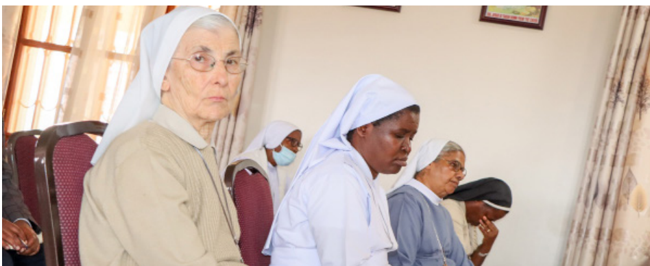
Sisters in a seminar to animate local and missionary Sisters, a way of promoting unity in diversity. (Cont. to Pg 4)