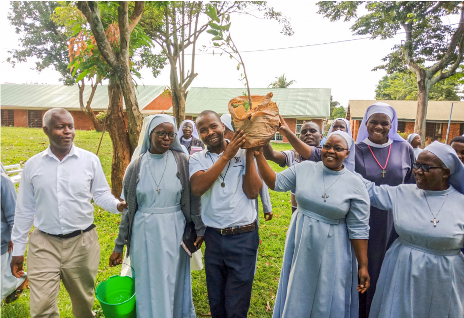
Consecrated persons celebrate the season of creation as they take to action by planting memorial trees at Uganda Spiritual Formation Centre Namugongo.