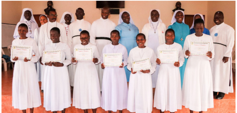
Novices continue to express their joy after the successful completion of the inter-institutional course at St. Mbaaga GGaba National Seminary.