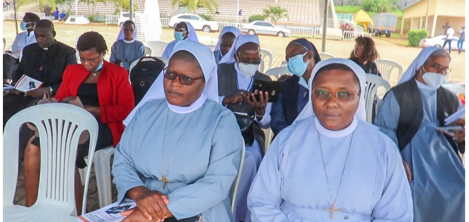
Rev. Sisters attending a National Prayer on Human Trafficking on Sept 9, at Kololo Ceremonial grounds. They spear headed the course.