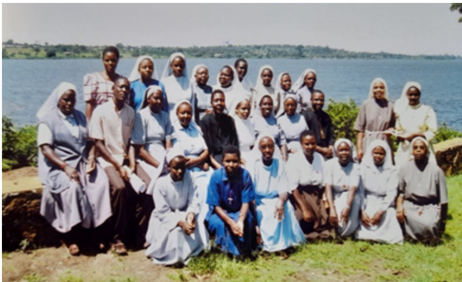
A group photo of Sisters during the ALL Africa Sisters to Sister (AACSS). File photo