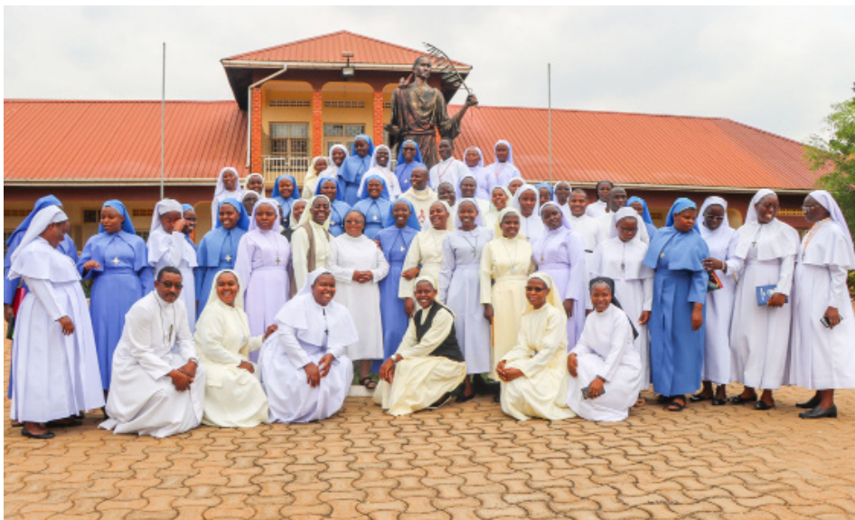
The Junior professed Sisters share a light moment with senior sisters shortly after successful completion of their course at St. Mbaaga Ggaba National Seminary.