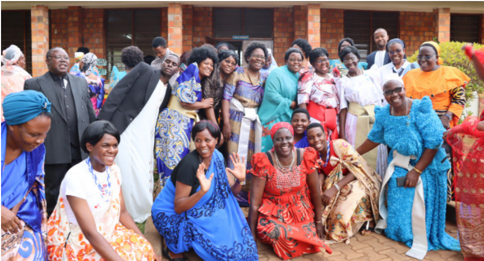
A group photo of consecrated Men and Women on cultural day celebrations at Uganda Spiritual Formation -Namugongo.