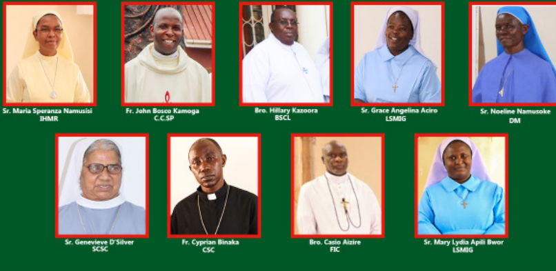
Montage of ARU Executive Members November 2022 - November 2024