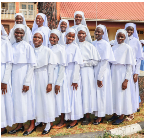
Some of the Novices share a light moment shortly after completing their Inter-Institutional Course at St. Mbaaga National Seminary.