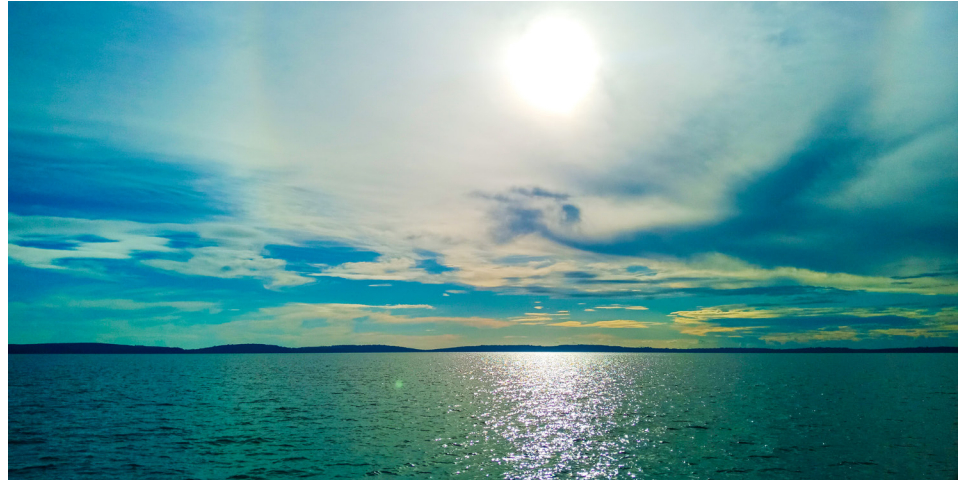
A spectacular view of L. Albert in West Nile, an example of keeping the planet clean.