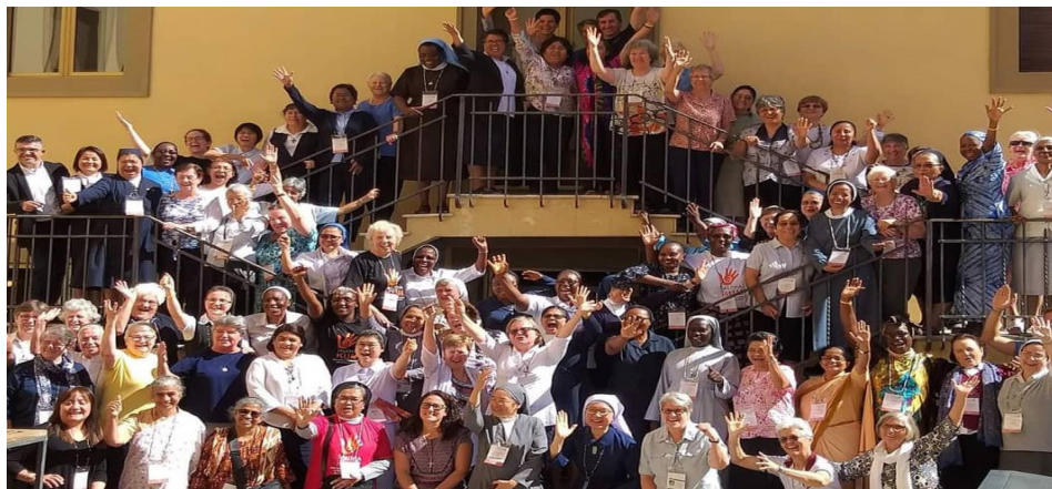
Unity in diversity as experienced during Talithakum Assembly in Rome (2019) by the global network of Consecrated Women