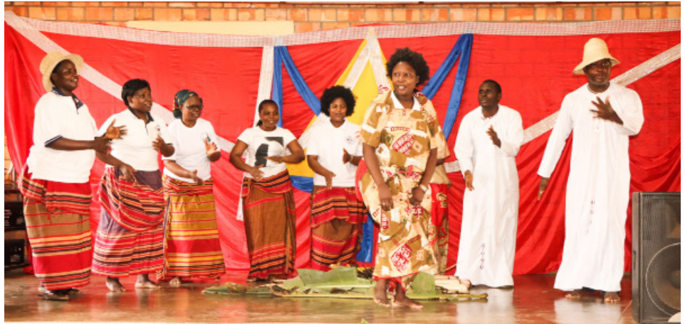
Consecrated Men and Women of God showcase their various talents of a presentation during the cultural day celebrations at Namugongo Spiritual Formation Centre.

This awareness and recognition of the dignity in each of these individuals fosters mutual-ity to give and receive from the other – and build relationships. That openness, born of deep respect for the dignity of every person, leads to trust the other.