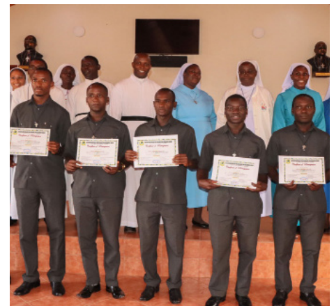
Novices who are being prepared into brotherhood receive certificates of successful completion of the Inter-Institutional Course.