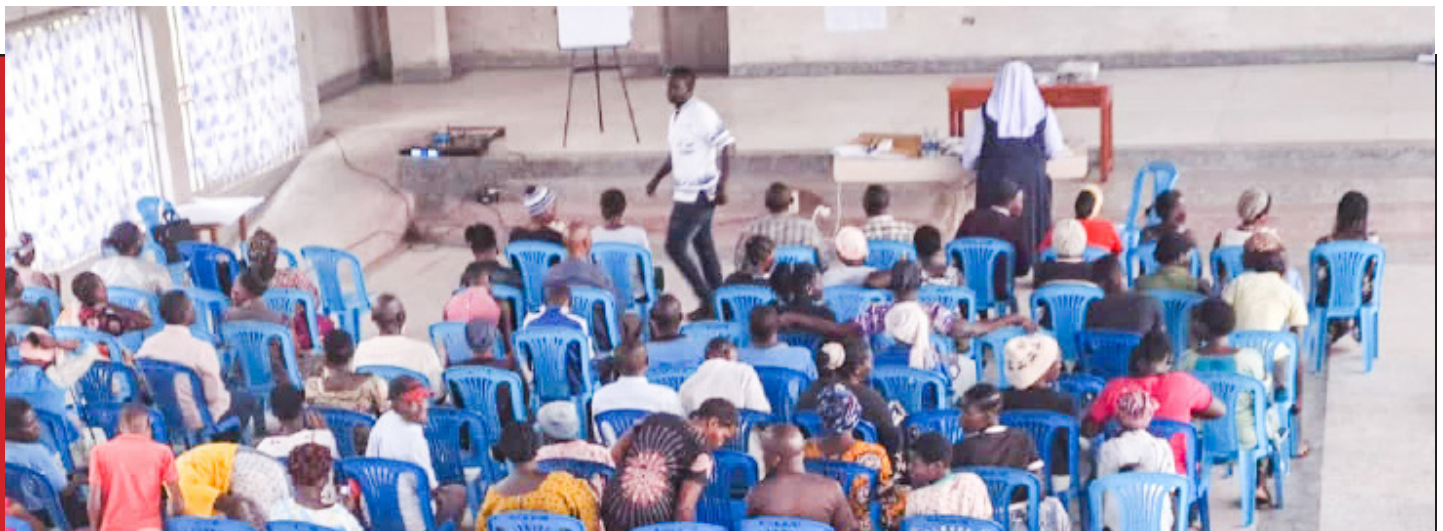
Parents attend in big numbers the parenting skills animated by Sisters. Courtesy photo from the field.

Since there were cases psychological breakdown, the training ended with a moment of prayer and celebration of Holy Mass and all parents were commissioned to practice parenting styles in families and communities.