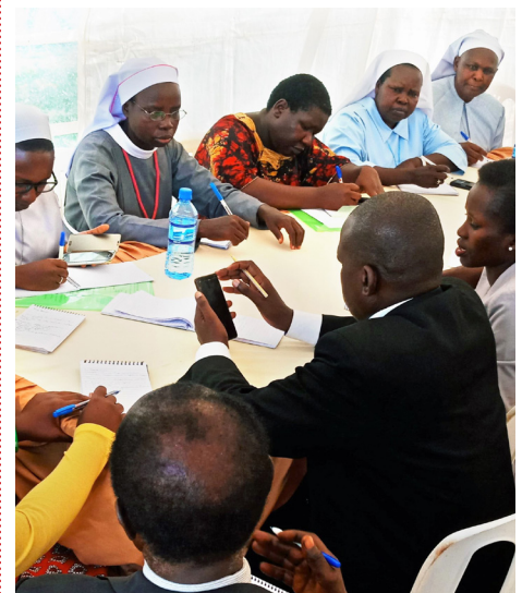
Catholic Sisters interface with the laity during stakeholders meeting at ARU Secretariat.

The culture of encounter to which both Pope Francis and St. Francis of Assisi calls us is both human and cosmic, (FT, 5). Each one is urged to open doors to embrace intercultural community, where people live as brothers and sisters in the planet earth, our common home.