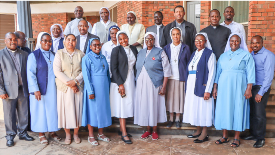
ACWECA and AMECEA Secretary Generals pose for a group photo during the second consultative meeting on the Synod of Bishops at St. Mary's Ggaba Major Seminary, Kampala Uganda.

Association of Member Episcopal Conference in Eastern Africa (AMECEA) in close Collaboration with Association of Consecrated Women in East and Central Africa (ACWECA) convened a consultative meeting on Synod of Bishops at St. Mary's National Major Seminary, Ggaba Kampala on August 25, 2022.