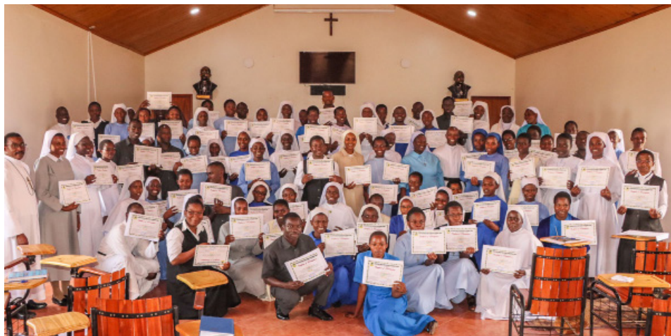
Novices beaming with smiles after a successful completion of their inter-institutional National Course at St. Mbaaga Ggaba National Seminary.