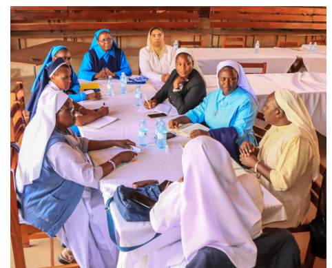
A group discussion of ACWECA Secretaries General on the Synod of Bishops.

The consecrated men and women are playing an instrumental role of collecting National Syntheses from Episcopal Conferences and come up with Regional Syntheses to be forwarded to SECAM by October, Compile the Conference reports for reference purposes and identifying key areas that cut across the conference which may not need the attention of the universal church and make a mechanism to address them locally in the region.