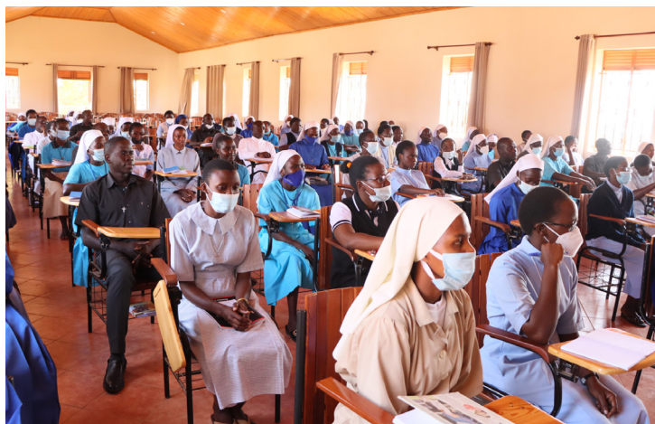
Novices attentively listening to the pieces of advice offered by ARU during the close of the inter-institutional course at St. Mbaaga, Ggaba Seminary.