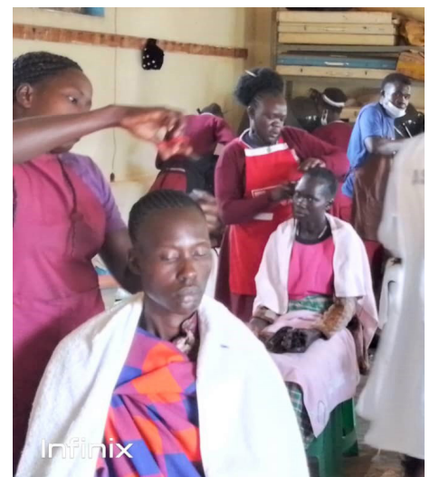
Hair dressing, one the skills Sisters embarked on to help youth become self sustaining.

We are happy to report that the youth eventually built confidence, now do networking among themselves freely and through the hands on skilling, they have high hope to live a better life. One of the key areas that enabled us document and register success is the fact that the project implementation was closely monitored and evaluated to assess its progress. Meetings with the administrators of the training institutions made this possible. They assured us of the confidence trainees built with no doubt of employment.