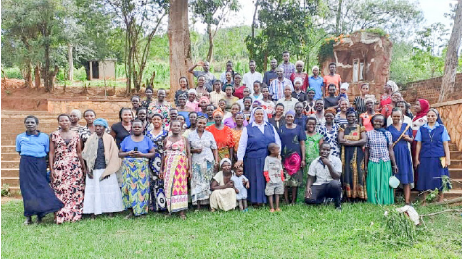
A group photo of the facilitators and participants during workshop on parenting skills carried out by sisters. Courtesy photo from the field.