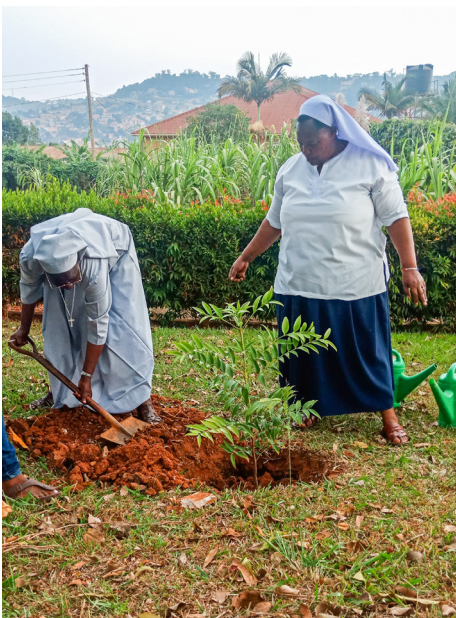
Sisters plant a tree seedling to animate environment. File photo

On the contrary, the fire that called unto Moses as he tended the flock on Mt. Horeb did not consume or destroy the bush. This flame of the Spirit revealed God's presence. This holy fire affirmed that God heard the cries of all who suffered, and promised to be with us as we followed in faith to our deliverance from injustice.