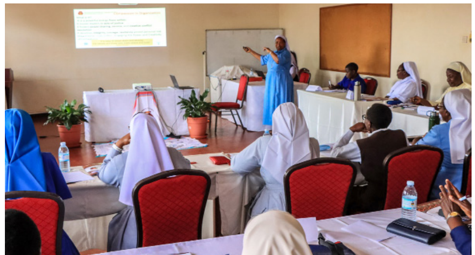
Professional Development for Congregational Leadership in session.

The next module for second group begins on March 14-20, 2023. The organizers expect more members to join. "We believe the first cohort shared their great experience with