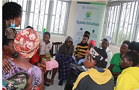
Retreatants and survivors of Human Trafficking during session.

At the end of the retreat, majority of the participants reported a great deal of relief and freedom after going through various sessions and therapy. Some of the testimonies included among others; “This prayer session gave me an opportunity to live again because; I had lost hope in life. Thanks to the Sisters of the Holy Cross for organizing such a wonderful program where I have discovered that I can still live again .....I was thinking about doing harm to myself but sharing with Sisters and Counselors during these sessions has given me life again.” Survivors were equipped with a number of soft life skills for