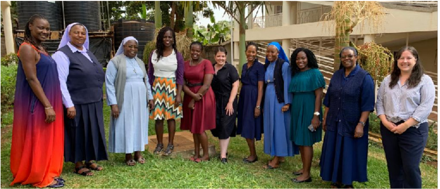
The guests from Spoon Foundation - USA in a memorial group photo with ARU administration shortly after the meeting at ARU, Secretariat - Kampala.

T he meeting culminated into development of a concept note on the same.