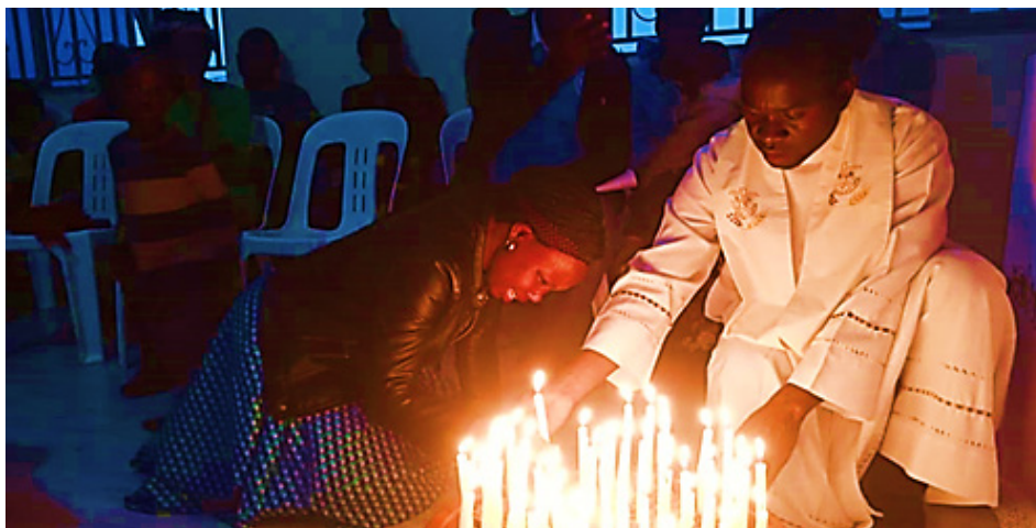
The Celebrant lights up the candles during adoration while one of the survivors breaks down in tears on remembering her experience while she was trafficked.