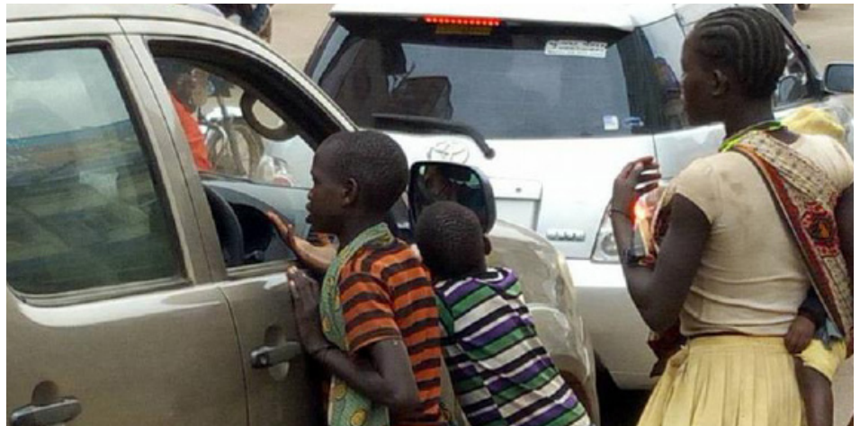
Courtsey picture of street children that visibly spark off emotions and desire to extend a helping hand towards them.

Some of the Aguu are children born to formerly abducted or returnees, rejected by family and community. While others are born to parents who were directly affected by the war. Victims of trauma and mental illness influenced others to join Aguu and gave way to children who resorted to delinquent behaviour. Some got caught up between the law of the land and parental discipline: "Some of us got into the habit of stealing and so we had to run away from home as they could no longer tolerate such habits, others gambled away school fees and or parents' money and ran away for fear of accountability and parents' reactions," some of the Aguu recounted.