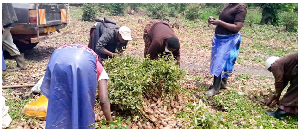
Our Lady of Fatima Sisters busy gathering tree seedlings for planting as a way of marking the season of creation.

The season of creation is an annual event that runs from September 1 - October 4, the Feast of St. Francis of Assisi, the patron saint of ecology. This year the Burning Bush symbolized the theme: "Listen to the Voice of Creation." On the right are the illustrated activities, Daughters of Our Lady of Fatima carried out to show their participation in the restoration of our common home, the Earth.