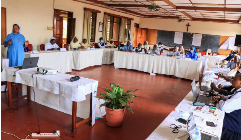
Contestants in Professional Development for Congregational Leadership session attentively listen to the facilitator' delivery