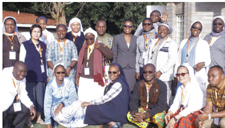
The participants of Talitha Kum Africa share a light moment together after the launch.

This is because anti-trafficking networks comprises people with complementary skills, committed to a common purpose and mutual accountability.