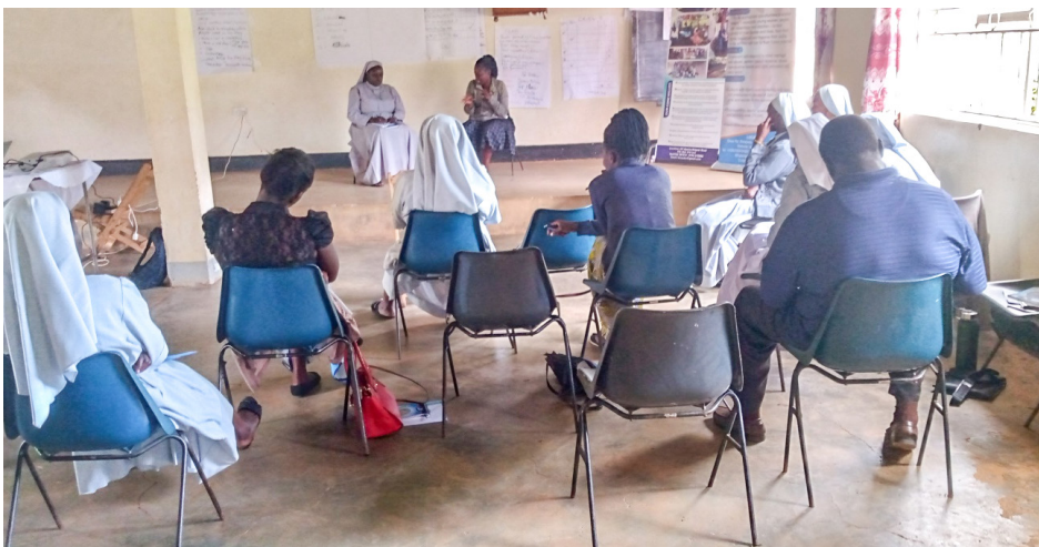
Catholic Sisters attentively listen to the facilitators during the skilling workshop skit session on child counseling in Lira.