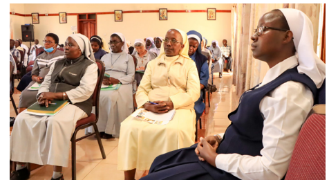
Below: Some members of the Assembly having a light moment