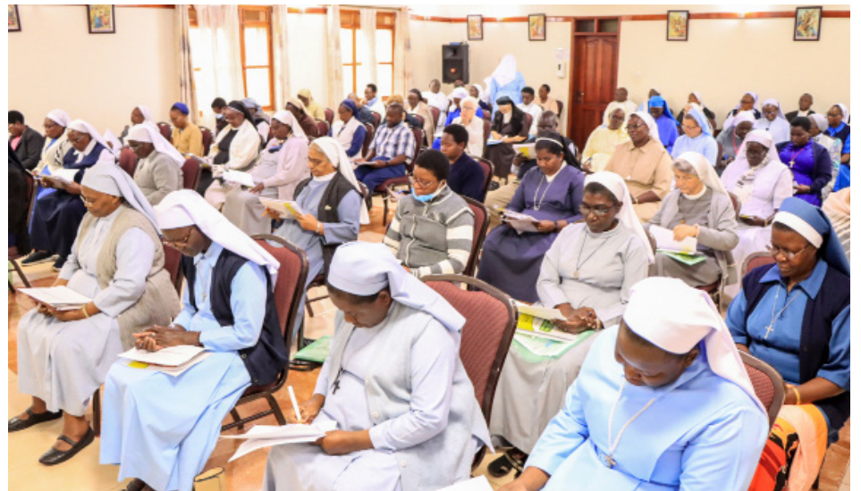
Top-Down: A crosssection of the Members of the Assembly in attendance in November, 2022, at ARU Secretariat.