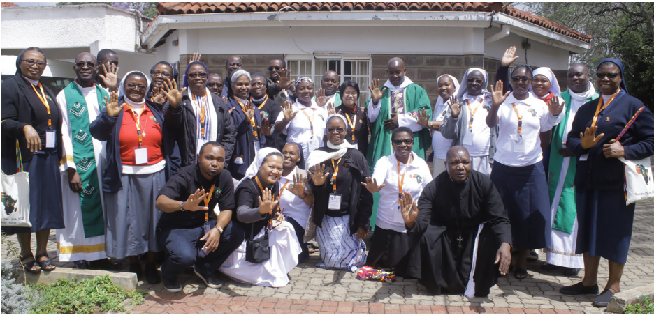
Consecrated Men and Women in group memorial photo during the Conference and launch of Talitha Kum Africa in Nairobi