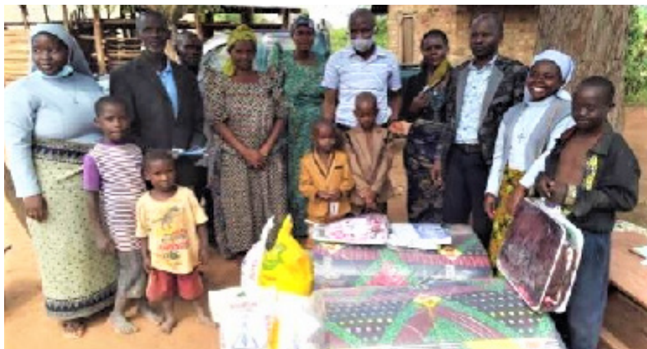
Sisters reuniting children with their parents after separation due to poverty.