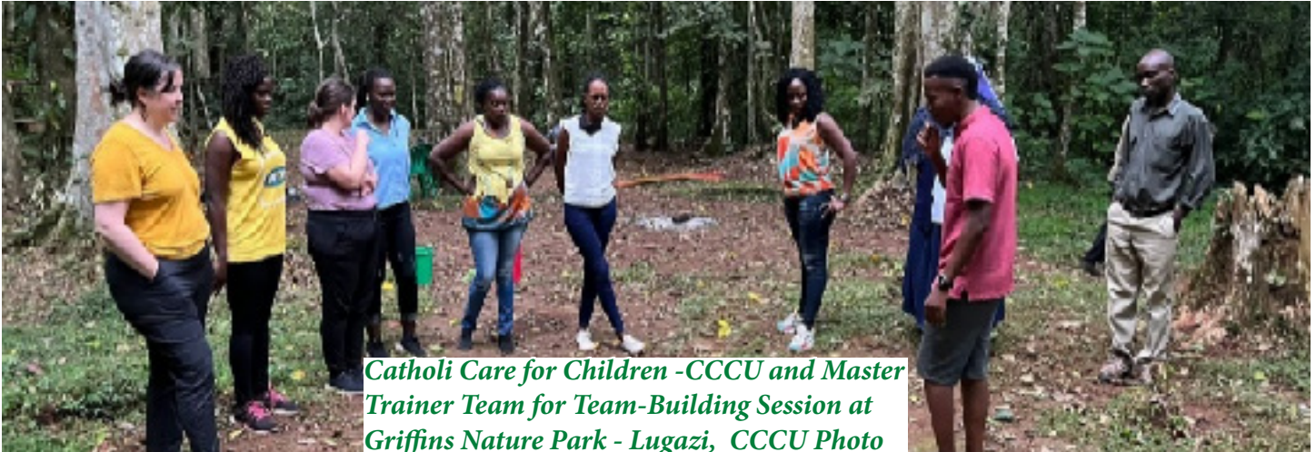
Catholi Care for Children -CCCU and Master Trainer Team for Team-Building Session at Griffins Nature Park - Lugazi

The week's activities were capped with a team building session at Griffins Nature Park in Lugazi for the whole CCCU/Master trainer team. The team building activity was later crowned with an evening chat and laughter at a sendoff dinner hosted at the Onomo Hotel Poolside.