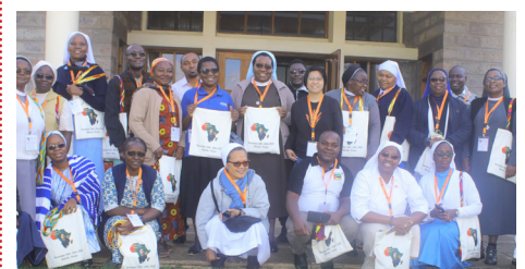
Participants pose for a group picture with branded Talitha Kum Africa bags ahead of the launch.

Through the networks and coalition, the Catholic Bishops in Uganda have written a Pastoral Letter on Trafficking in Persons. "Break the Yoke" Isaiah 58:6. It was released on September 9, 2022, the day of a joint national prayer on Trafficking in Persons at Kololo ceremonial grounds. We look forward to launching the Pastoral Letter soon.