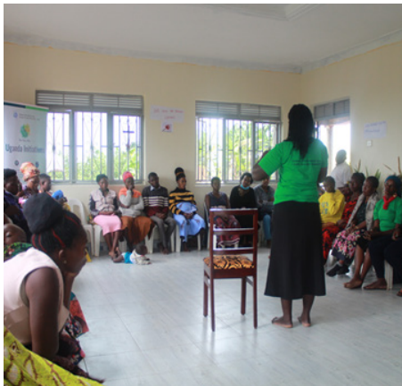
Retreat of the survivors of Human Trafficking in session.

Facilitators endeavored to portray the connection between spiritual and physical healing to survivors through sharing experiences in groups of those who were sexually abused, forced into marriage at a young age, trafficked because of domestic violence and poverty, among others. Through these groups, participants were able to identify their specific abuse experiences and were guided by the facilitators and counselors on what they can do to overcome their challenges, fears and hurting feelings.