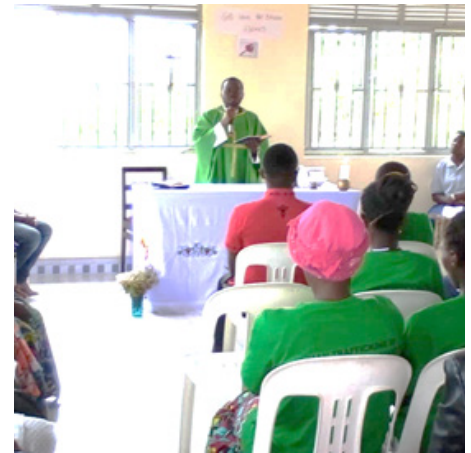
Survivors of Human Trafficking together with other retreatants participatin in the Holy Mass.

By the end of the workshop and prayer, participants attained; psycho-spiritual exercises, health consultations and guidance, group and individual counseling, entrepreneurship skills. Many Sisters who participated were empowered as well.