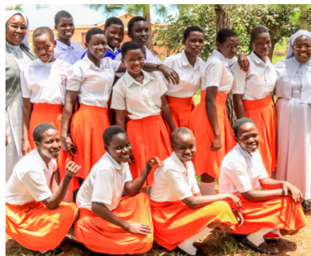
Dokolo secondary students pose for a group photo with Sisters.

All the schools face food shortage after COVID - 19 pandemic, the long droughts. Karamoja was the worst hit. They could not complete their first term and even if they were called back, food remains inadequate.