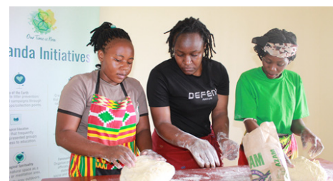
Survivors of Human Trafficking experimenting hands-on skills during the retreat.

All participants were encouraged to seek psychological counseling since counselors were present. This included religious sisters and other professional counselors. In the same spirit, survivors were encouraged to share their testimonies with Sisters. It was pain-relieving though an emotional experience. The presence of sisters was significant for lending, “a shoulder for crying upon, a means of providing an empathetic gesture and support to the survivors,” a sister noted.