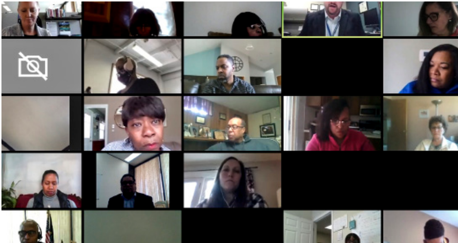
Courtsey picture of a zoom meeting, a mode that was used to conduct communication training for Sisters and volunteers. (Fair use of the picture)