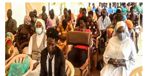
Sisters and lay christians attending the workshop on skills in child counseling.