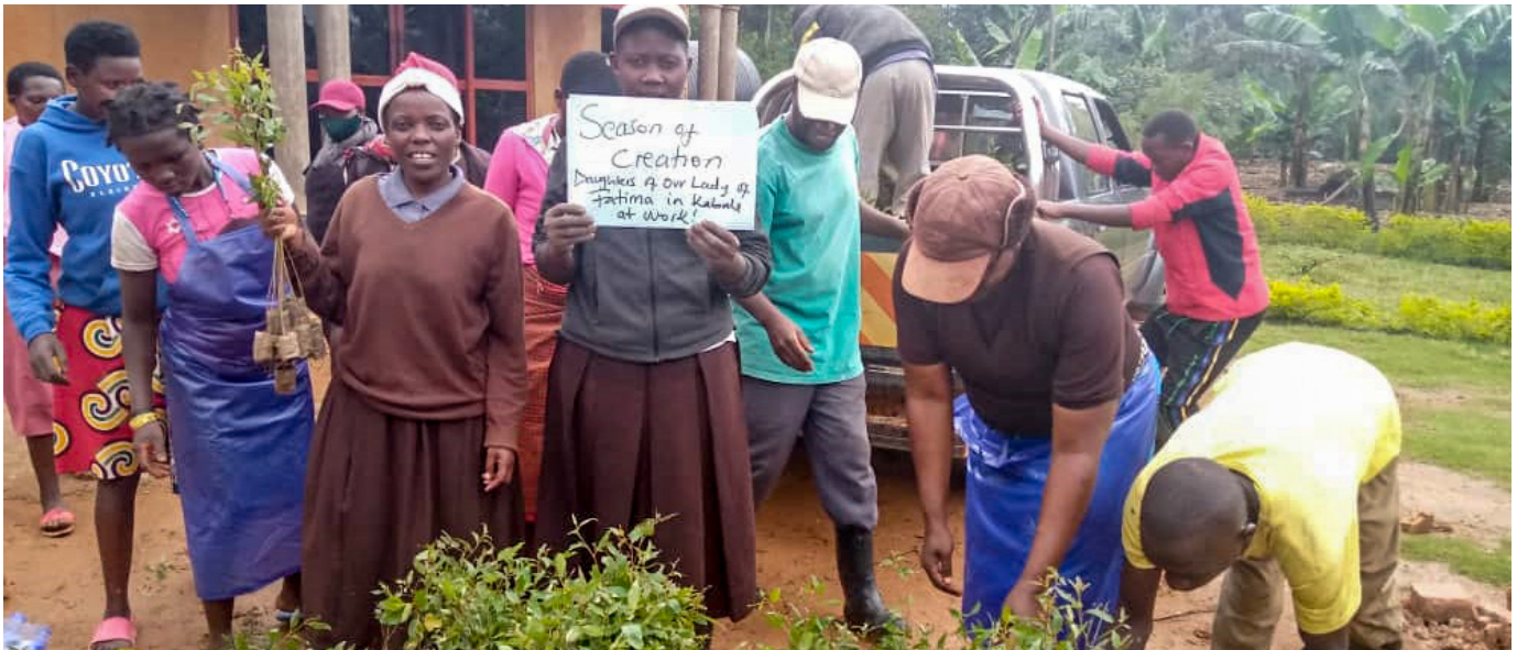
Sisters of Our Lady of Fatima from Kitumba Rushoroza , Kabale Diocese actively participate in the season of creation by embarking on planting trees to restore mother earth.