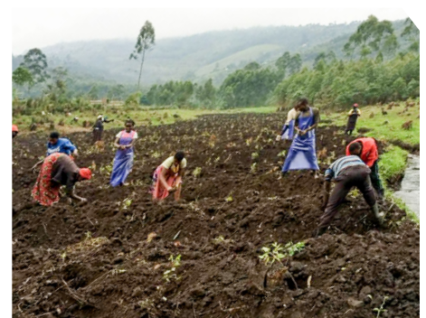
Our Lady of Fatima Sisters on a tree planting activity to mark the season of Creation.