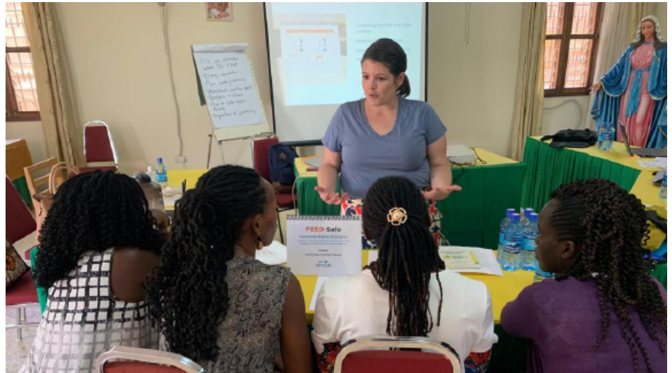
Spoon Foundation facilitator during a workshop on Strengthening Nutrition and Feeding for Children in Institutional Care project at ARU Secretariat - Kampala.